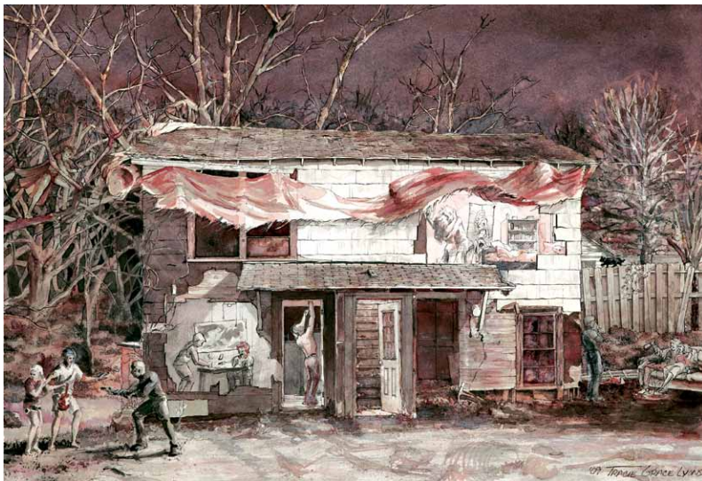
BOTTOM: Age of Enlightenment , Watercolor, pen, and ink on paper, 14" x 21"